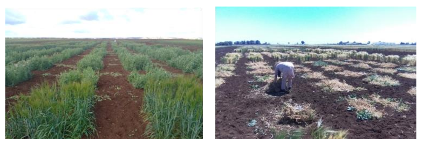
Fig. 2. Overview of the evaluation experiment in Marchouch in 2021-22 during the crop cycle and at crop harvest

The selections were evaluated in field experiments under autumn sowing in inland Morocco (Marchouch) for two cropping years, i.e., 2021-22 and 2022-23 (Figure 2).