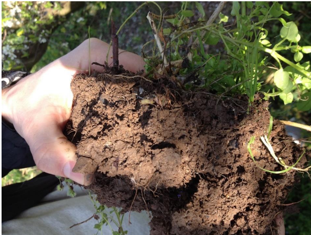
Fig. 1. Soil organic carbon is a key indicator of soil health.

Furthermore, in Mediterranean conditions, it is foreseen that global warming will not only result in an increase in air temperatures but also a reduction in annual precipitation (Cramer et al. 2018). These changes in climate will affect soil processes and microbial activity with the concomitant impact on SOC dynamics and turnover. For this reason, in the project CAMA, it was key to assess the real impact of CA on SOC changes not only under present climate but also under future climate conditions.